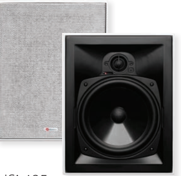
HSi 485 2-Way 8"In-Wall Speaker